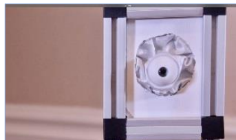
BIObot simulated eye closeup