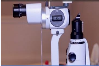
Side view of OEBC slit lamp showing the location of magnification knob