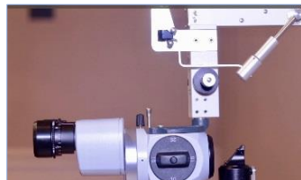
Close up of slit lamp mounted Goldmann tonometer.