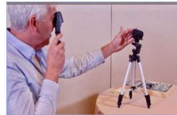
Retinoscopy model eye in action