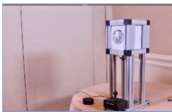
OEBC's proprietary BIObot