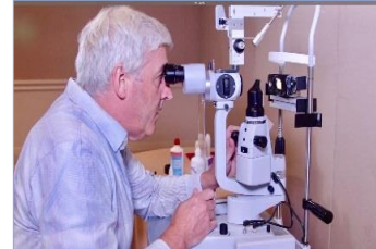
An Examiner using OEBC slit lamp demonstrating the Gonioscopy and tonometry model