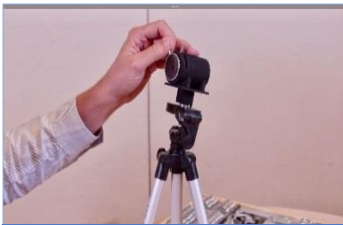
Model eye for retinoscopy