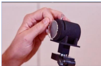
A close up of the retinoscopy model eye