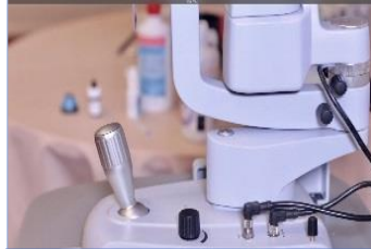
Side view of OEBC slit lamp showing the location of dimmer knob