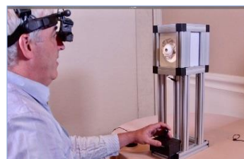
BIObot- showing the use of the joystick to control the direction of gaze