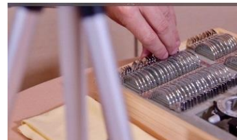
Close up of supplied trial lens case